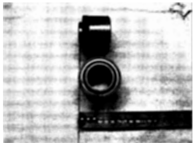
• AR1 Hub bearing kit