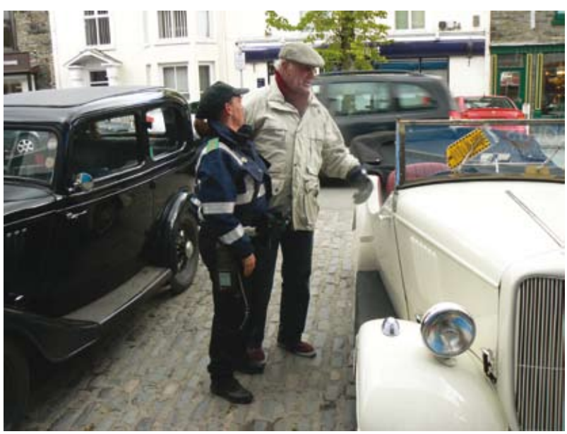
A re-enactment of your Editor's parking ticket farce in Llangollen: this time with a friendly parking lady in Bala.