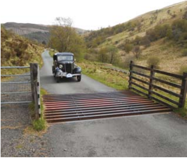
Clive travelling the Foel y Geifr pass en route to Bala.